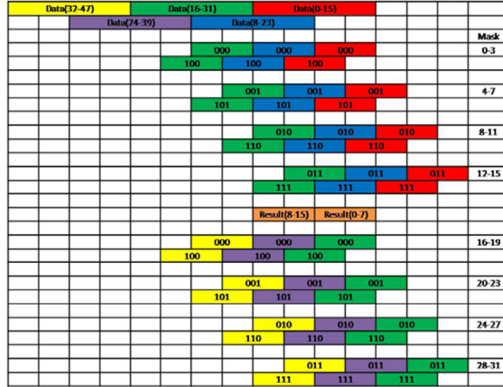
Figure 1. Computational arrangement for fast pattern matching. Data inboxes is the imm8 value

The main decision in the GPU programming is the design criterion of how memory will be used. We have decided to place the mask data in constant memory and the image and the result data in global memory. The image is constant in the algorithm but it does not fit in the small constant memory of the GPU. The CUDA programming methodology [Nvi09a] allows arranging the processors as a grid of threads. In our problem, the grid of threads is configured by assigning a thread to each result pixel at (x, y) excluding the border band; that is, each thread is involved in the computation of a R(x, y) result. To reduce the negative effects of memory access, the mask data are placed in constant memory because this type of memory is cached and is smaller in size than the mask data. Also, we take advantage of broadcast access to that memory type because for (u, v) values of the mask indexes all the threads access to the same M(u, v) , which takes advantage of the broadcast access to constant memory.